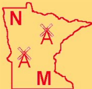
Netherlands-American Association of Minnesota